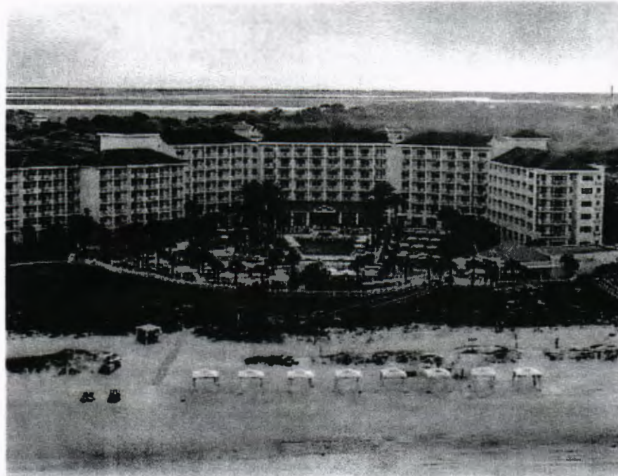
Omni Amelia Island Resort