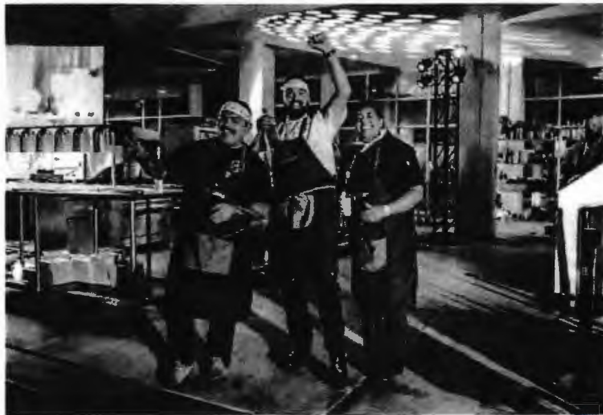
Omni Amelia Island Resort Marketing

There were three categories of competition: Chef's Choice, the dish voted best by the chef's fellow competitors; Individual Challenge, the appetizer dish voted best by guests; and Team Challenge, the winner of the final cooking competition with the secret ingredient, voted by guests.