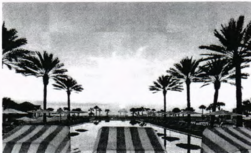
Omni Amelia Island Resort

While the lineup of impressive chefs and their unforgettable dishes were no doubt the stars of the show, the breathtakingly beautiful Omni Amelia Island Resort couldn't help but shine in its own spotlight.