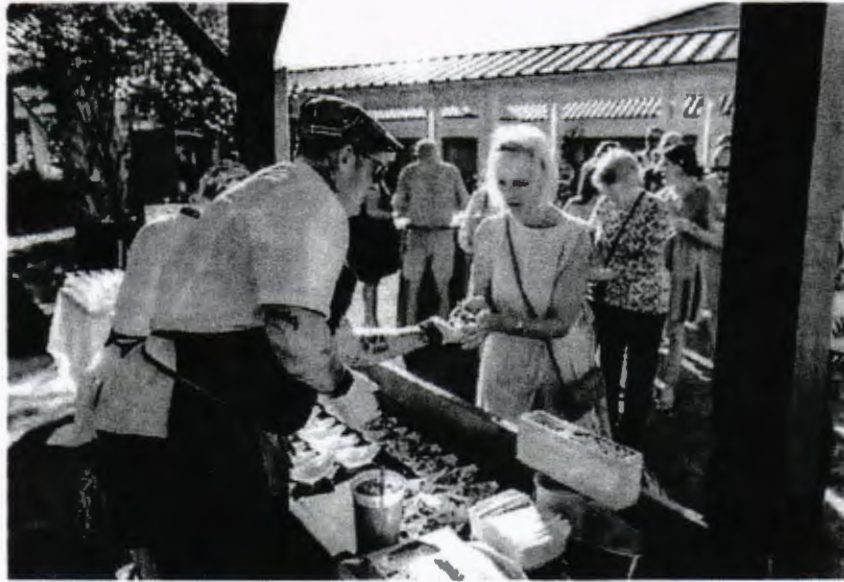
Omni Amelia Island Marketing

Saturday night's main event was held in the property's beautifully lush Magnolia Garden, where each chef had a booth to serve his or her culinary creation made from the previous day's catches. The delectable seafood samplings included chowders, ceviches, taquitos, curries, and other delicious bites, each complimented with its own unique cocktail—a touch many guests obviously adored.