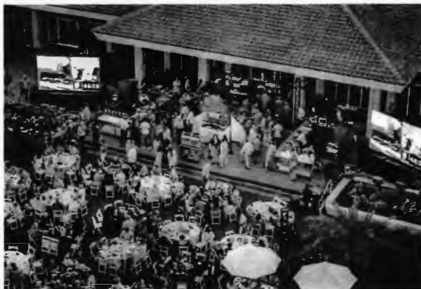
Omni Amelia Island Resort Marketing

As guests trickled into the main party from the tasting booth reception area, the chefs were given just a few minutes to wrap up their individual tastings before being randomly grouped into two teams. The teams were to compete in a head-to-head, hour-long cookoff featuring a secret ingredient that had yet to be announced.