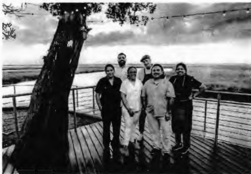
Omni Amelia Market